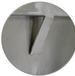
Lifting handles on the width